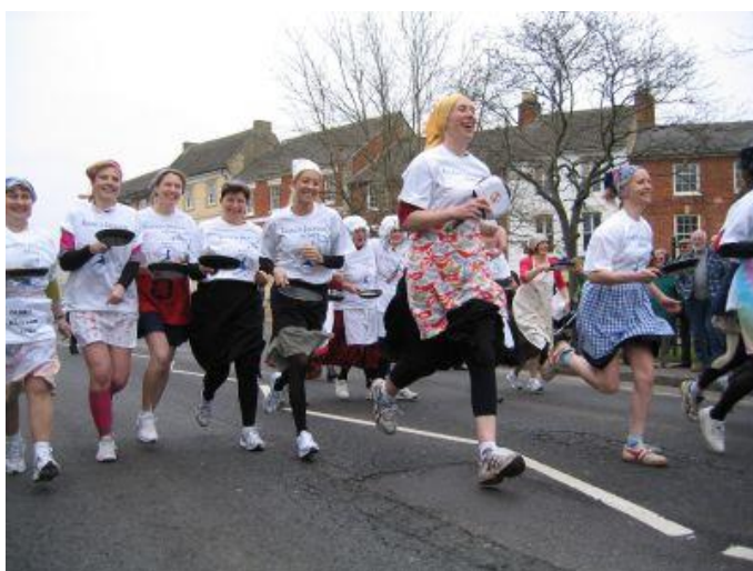
The picture is of the world famous Olney pancake race which has been running since 1445 on Shrove Tuesday. The race starts from 11:55. Its certainly worth a day trip!

Once you've turned the pancake let it cook on the other side for a minute or two until it colours up well.