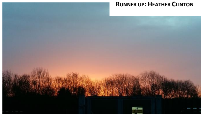
RUNNER UP: HEATHER CLINTON