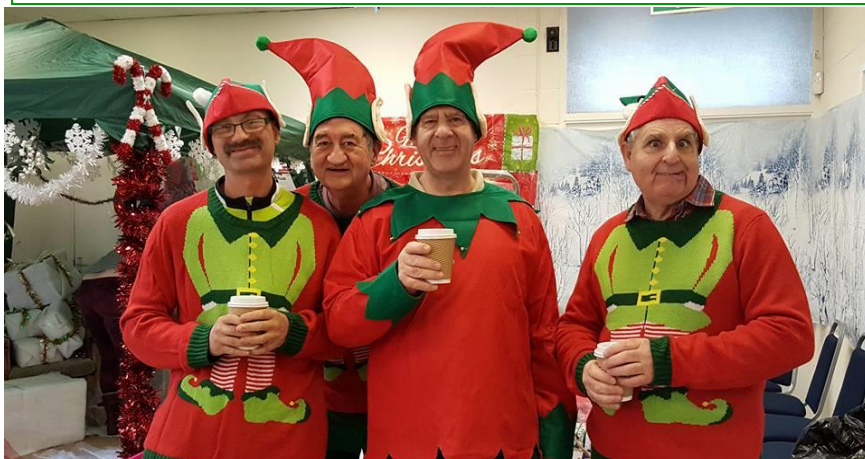
ELVES HAVING FUN AT THE CHRISTMAS PARTY ON THE 3 RD DECEMBER