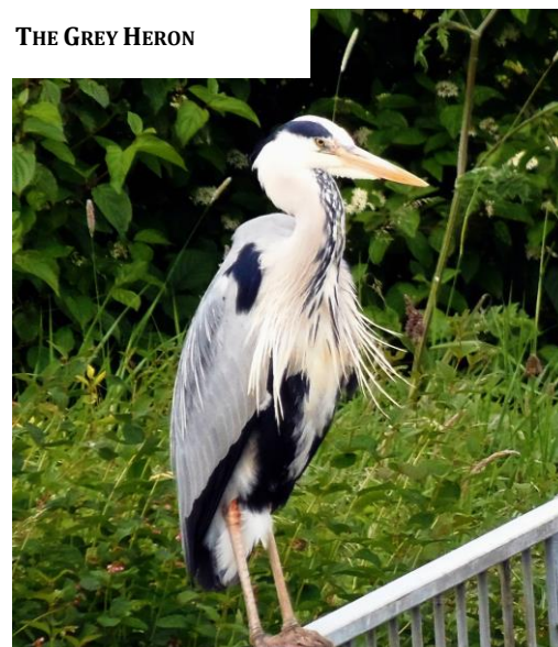
THE GREY HERON

You will often see a grey heron on the estate. They are beautiful and also one of largest birds at 90–98 cms in length. You may spot their heronry high in the tree tops near Walton Park. Our native herons are joined in the winter by overseas visitors from colder climes. Be sure to cover your ponds with netting in spring or the herons will take any fish or frogs that they spy!