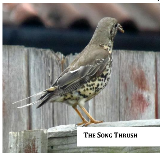
THE SONG THRUSH

Another bird I hope you will see is the Song Thrush. Unfortunately, this handsome bird, about 23 cms in length, is on the red list of endangered species. He likes to nest in shrubs and bushes and particularly ivy. Numbers are reducing as people cut down hedges. If you're lucky you may see one smashing a snail shell against a rock or stone so that he can reach the tasty contents. If you want to tempt the song thrush into your garden offer some dried worms and peanuts on the ground close to the cover of bushes.