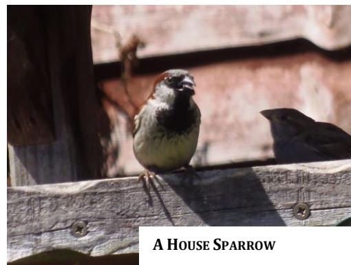
A HOUSE SPARROW

We occasionally see a real House Sparrow here in Tinkers Bridge, with its white collar and black throat. These birds are now red-listed as a species of high conservation concern. The small, secretive and shuffling Dunnock is often mistaken for a sparrow and we have many of these. Both birds are about 14 cms in length. Look at the differences.