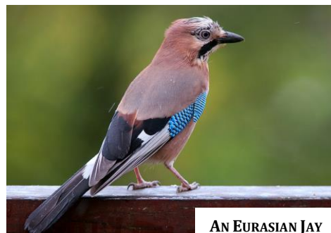
AN EURASIAN JAY

Jays are difficult to see as they are shy woodland birds that rarely move far from cover. However you might tempt them to your garden table with fat balls or peanuts. Watch out for a handsome bird, with its distinctive flash of white on the rump, flying between the trees; it will signal its presence with a screaming call. He is about 35 cms in length. I love his blue wing patches and his black moustache. Like squirrels these clever members of the crow family bury acorns in autumn and then retrieve them to eat later in the winter. Some Jays remain year-round in England but there are also winter visitors from colder countries.