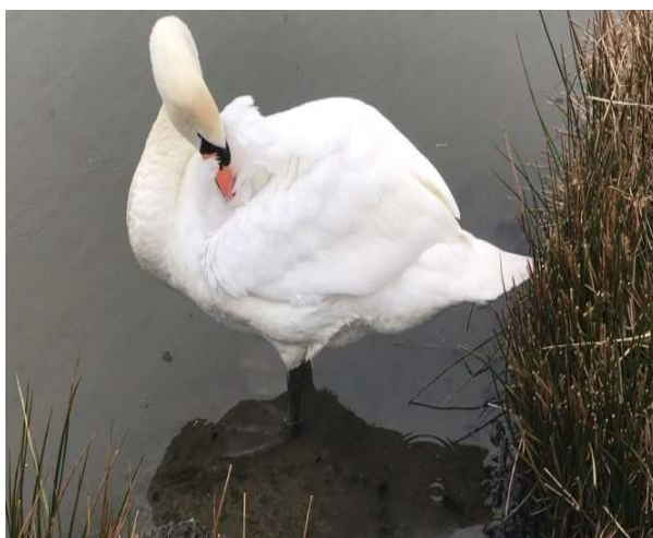
Major sprucing up!